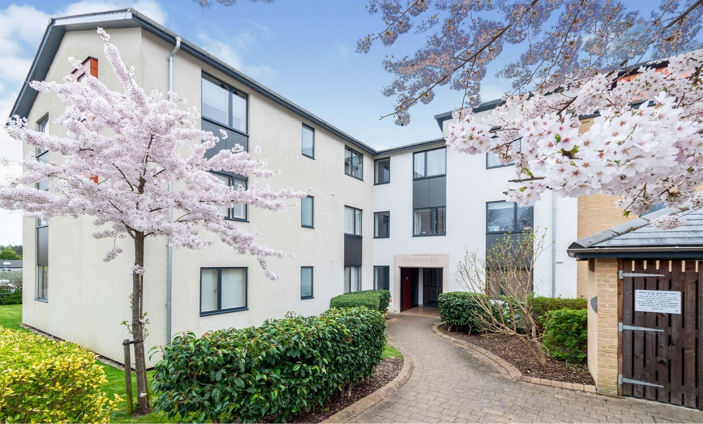
Newhaven, Drakes Drive, Stevenage SG2 0EY