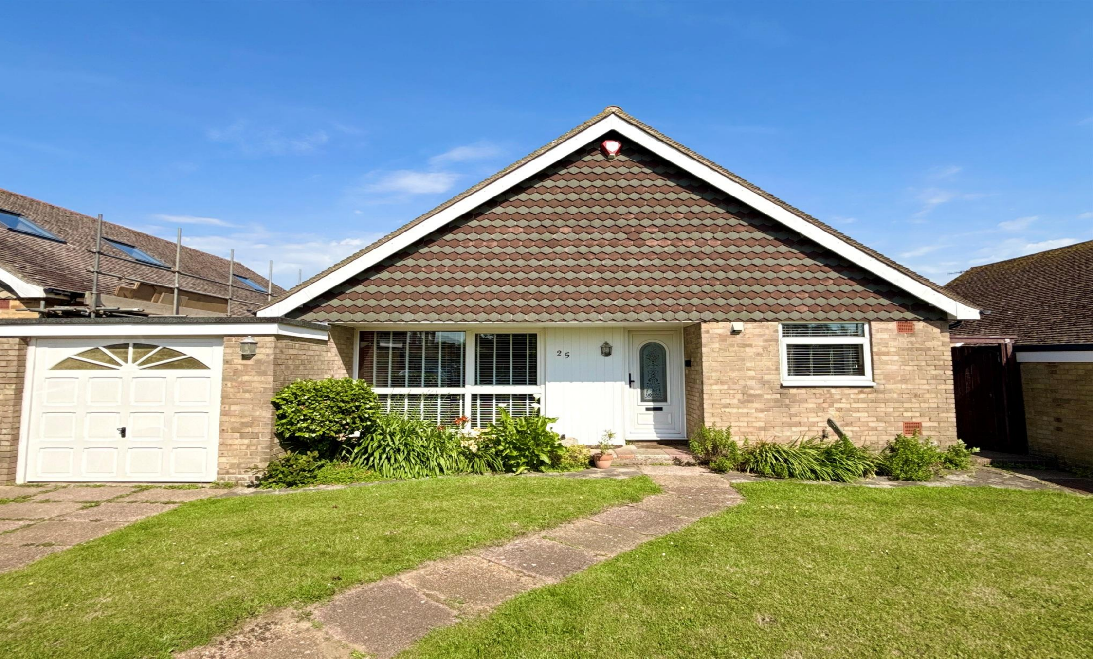
Mulberry Close, Shoreham-By-Sea BN43 6TF