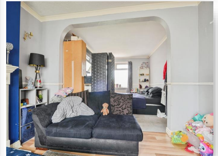
Malvern Road, Stockton-On-Tees TS18 4AU