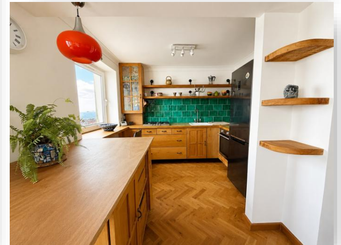
Harbour Tower, Trinity Green, Gosport, PO12 1HF