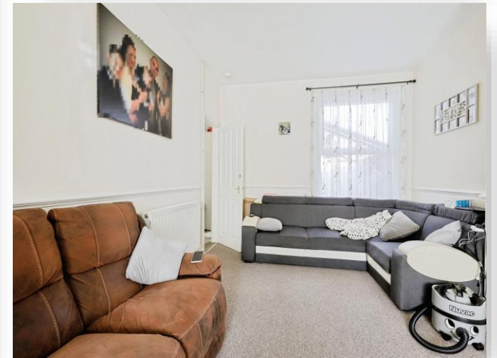
Euston Road, Northampton NN4 8DT