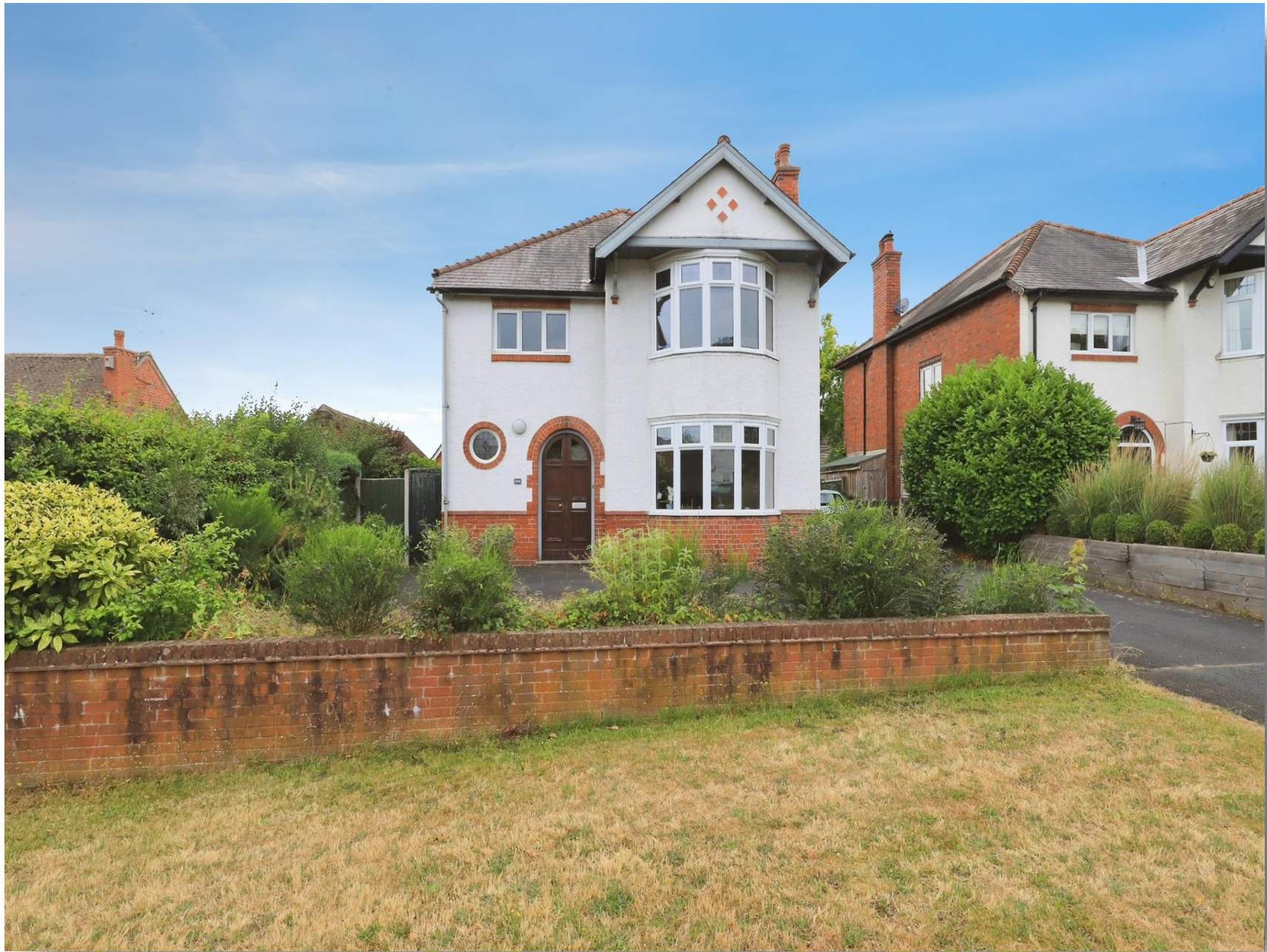
Stourbridge Road, Hagley Stourbridge DY9 0QS