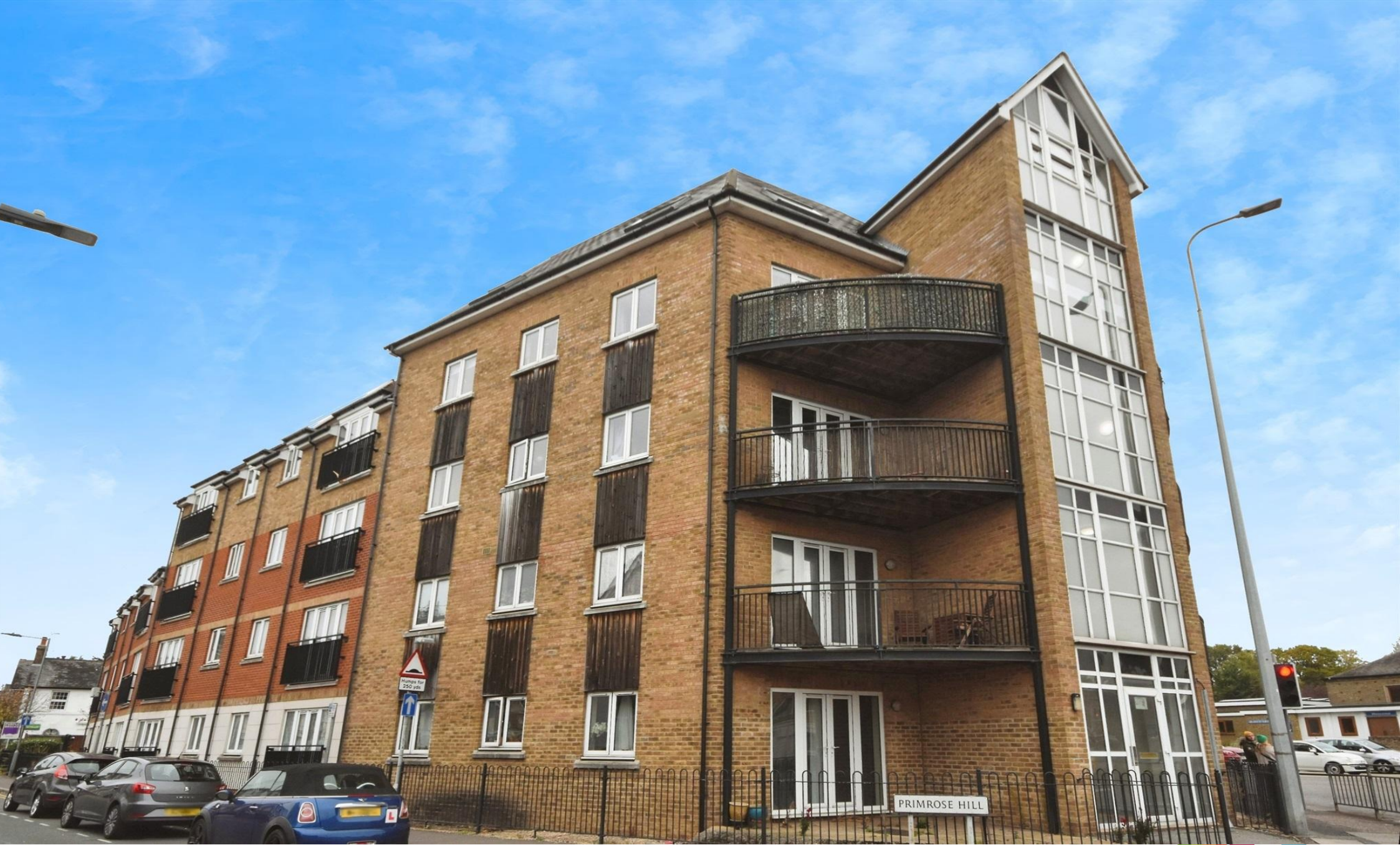
Primula Court Primrose Hill, Chelmsford CM1 2FZ