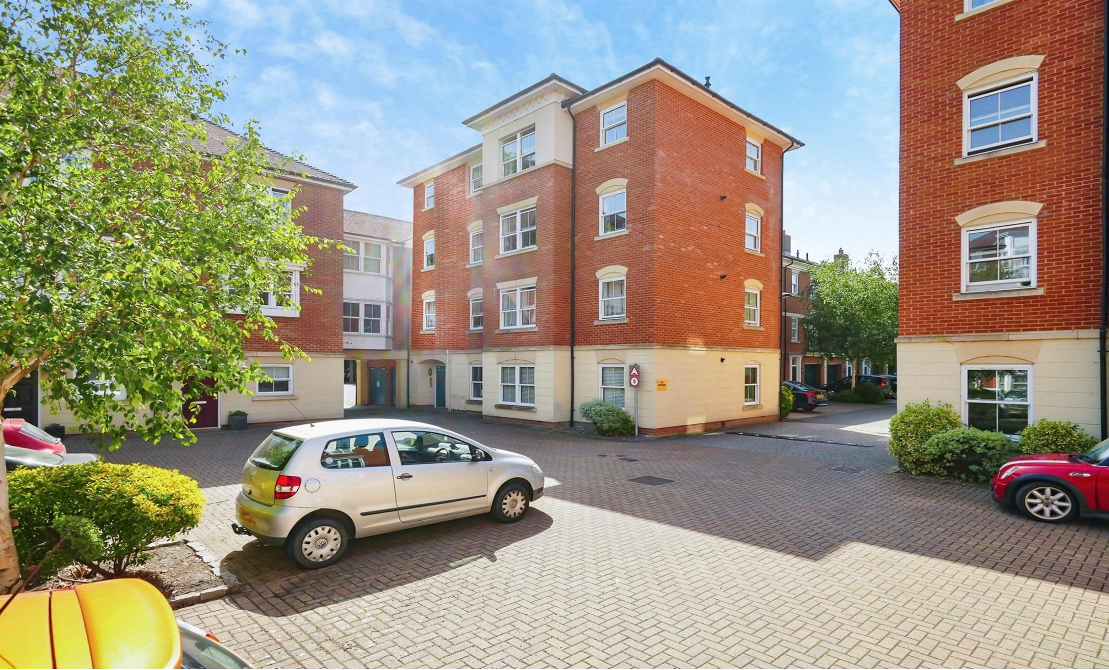
St. Gabriel's, Wantage, OX12 8FJ