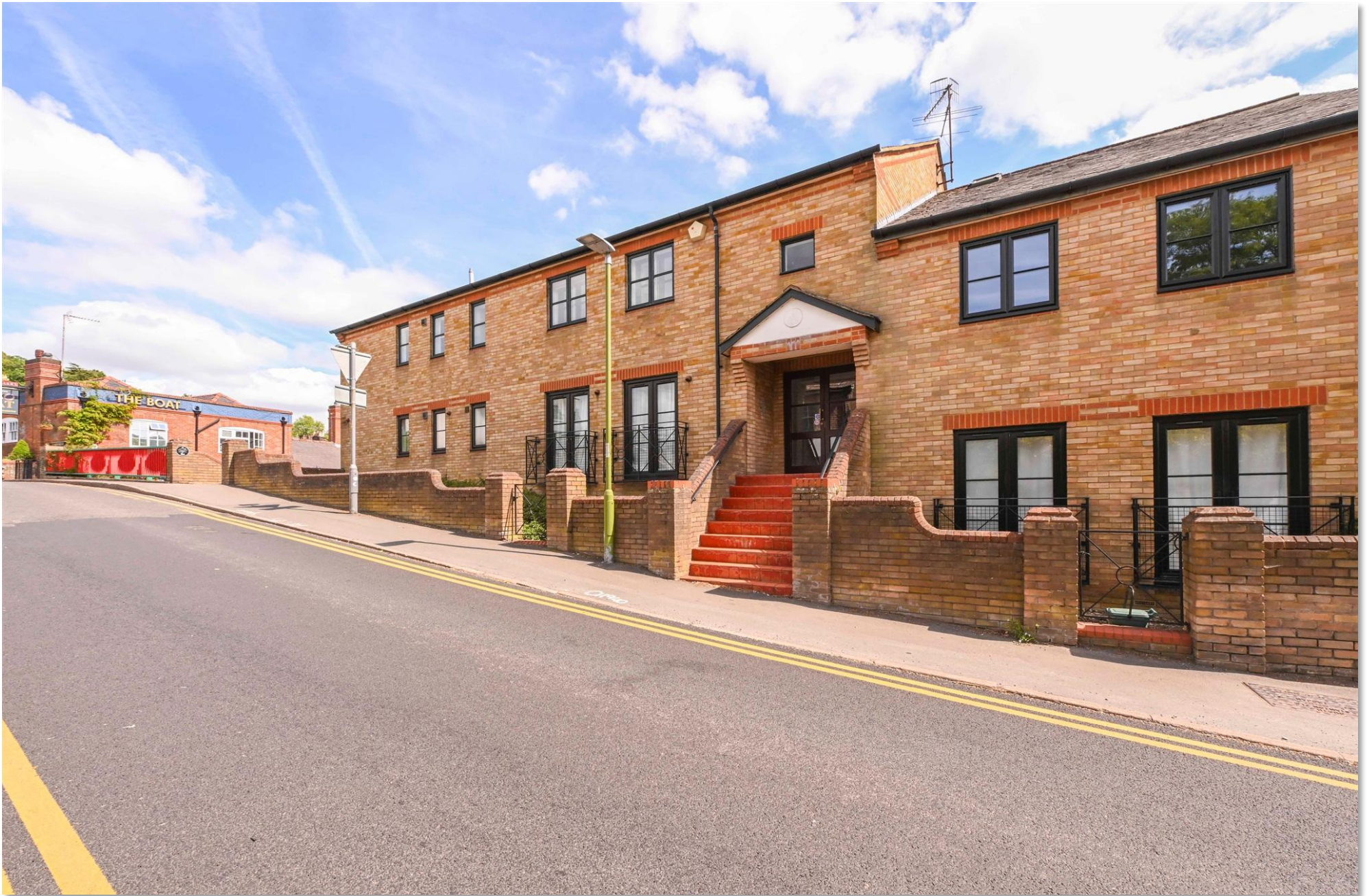
Ravens Wharf Ravens Lane, Berkhamsted HP4 2UA