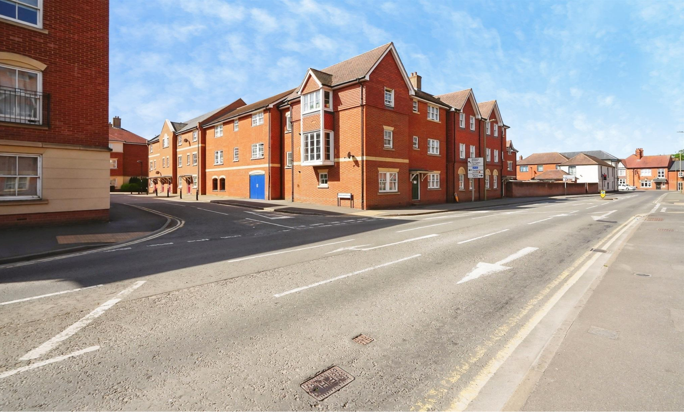
St. Gabriel's, Wantage, OX12 8FJ