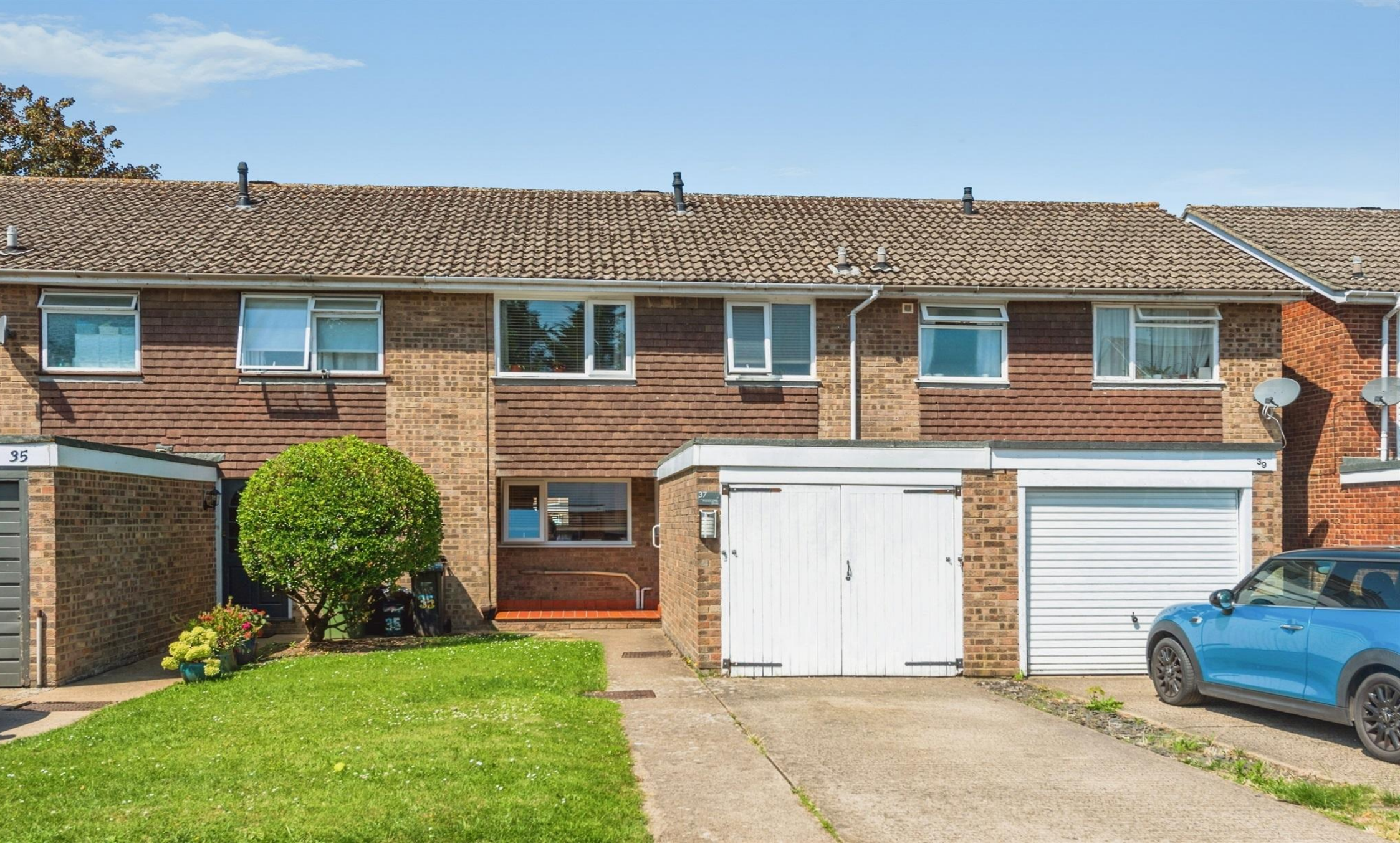
Francis Little Drive, ABINGDON, OX14 5PN