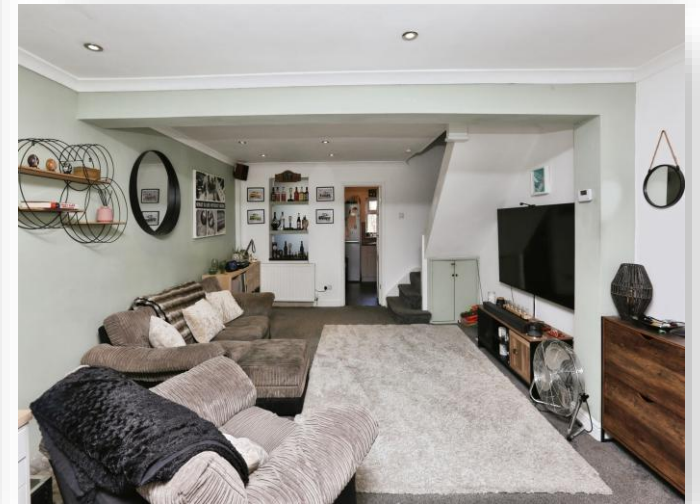
Forton Road, Gosport, PO12 3HW