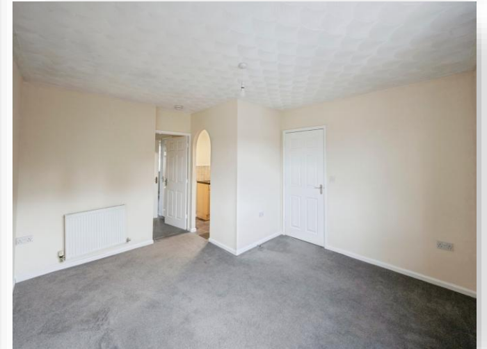
Loscoe Grove, Goldthorpe Rotherham S63 9GH