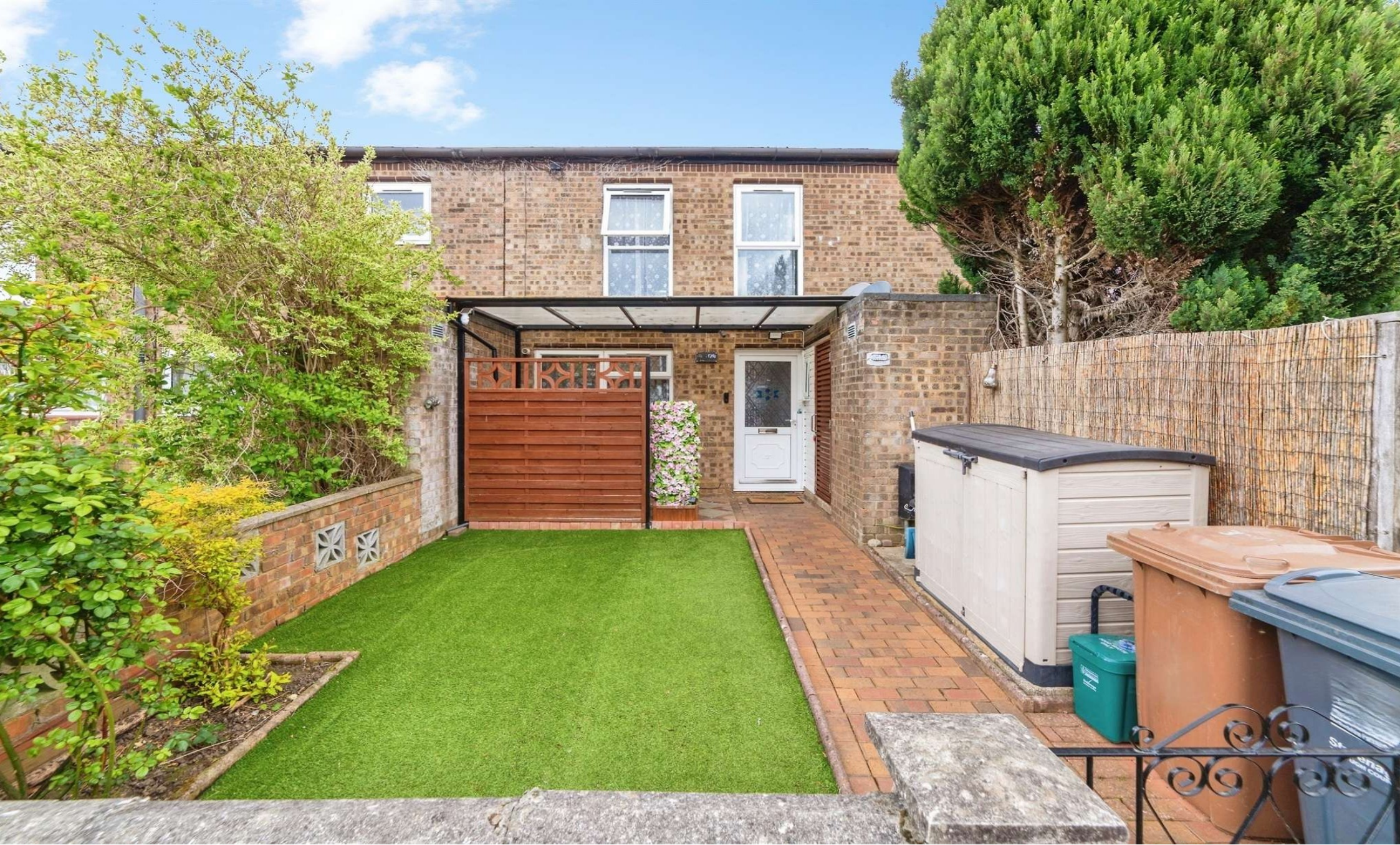
Ripon Road, STEVENAGE, SG1 4NQ