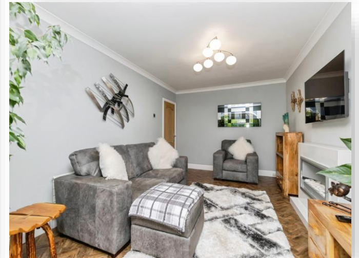
Castleton Drive, Billingham TS22 5AR