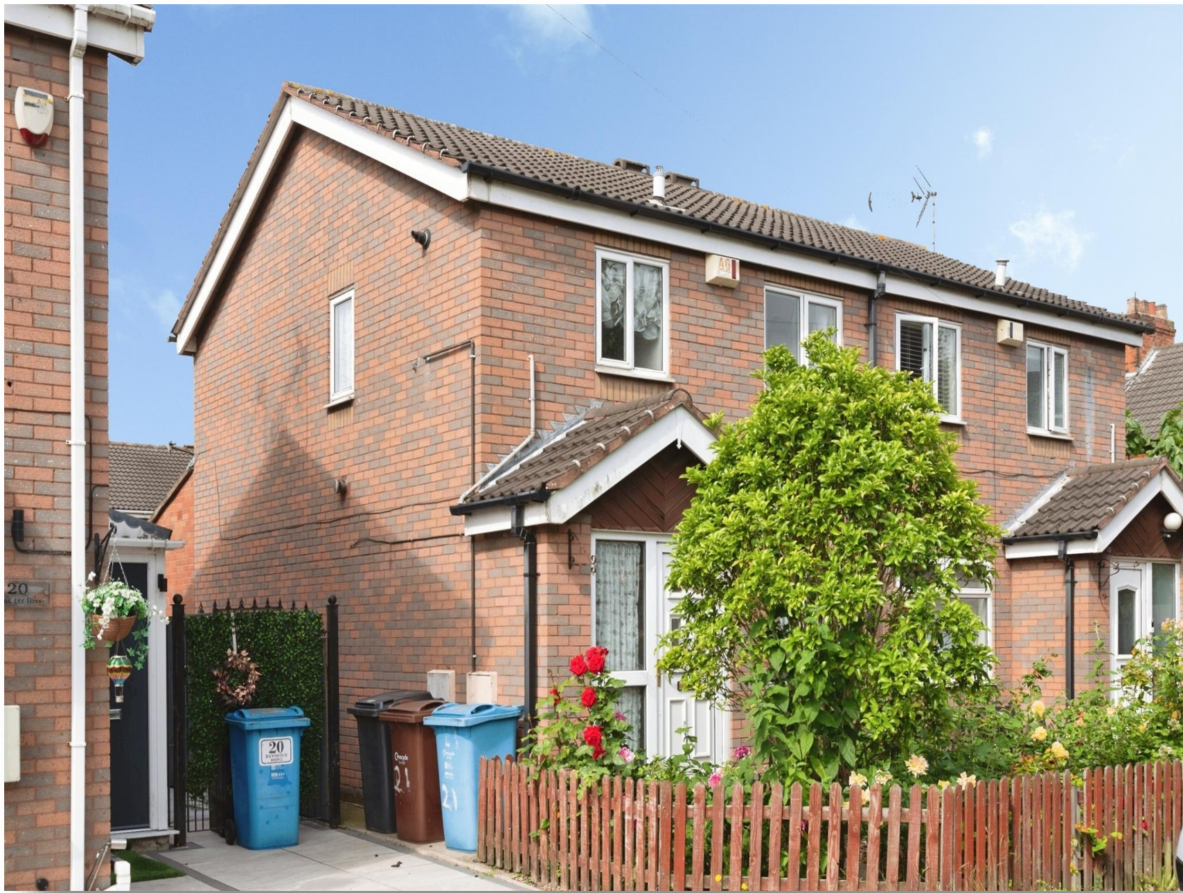
Bannister Drive, Hull, HU9 1EJ