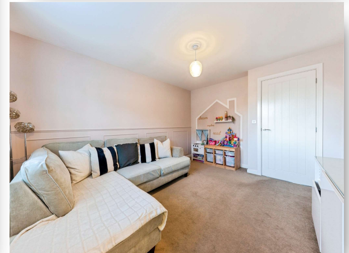
Charters Drive, Middlebeck Newark NG24 3XD