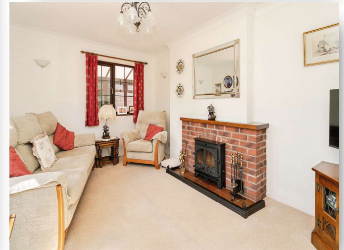
Whissonett Road, Colkirk, Fakenham, NR21 7NL