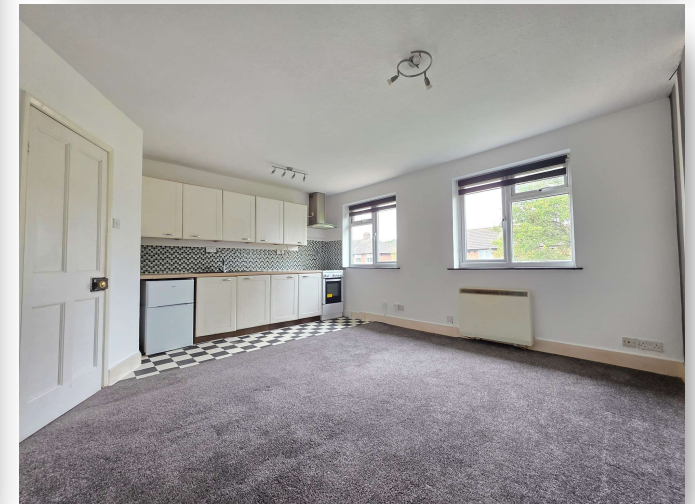
Clinton Crescent, Aylesbury HP21 7JN