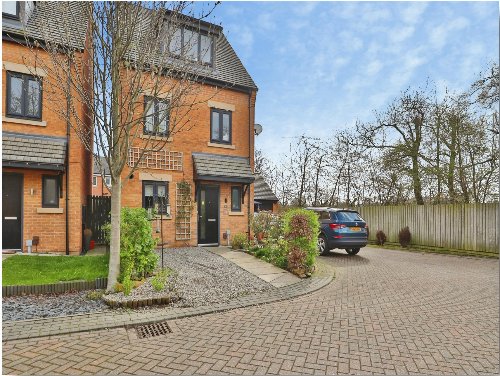
Elsie Bruce Grove, Crossgates LEEDS LS15 8FN