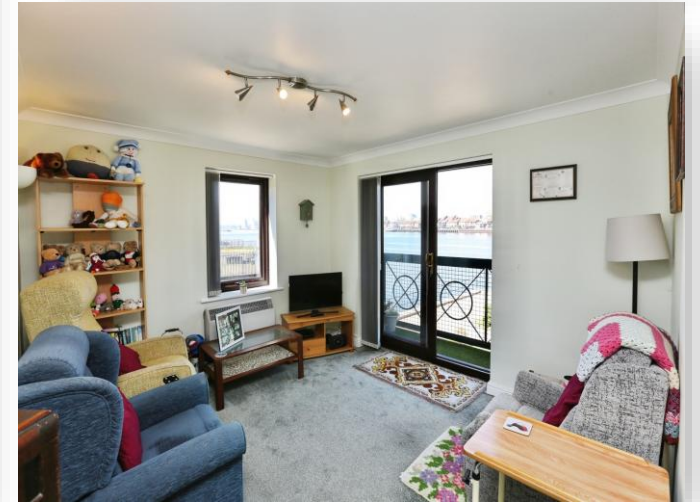
Spitfire Court, Mitchell Close, Southampton SO19 7TN