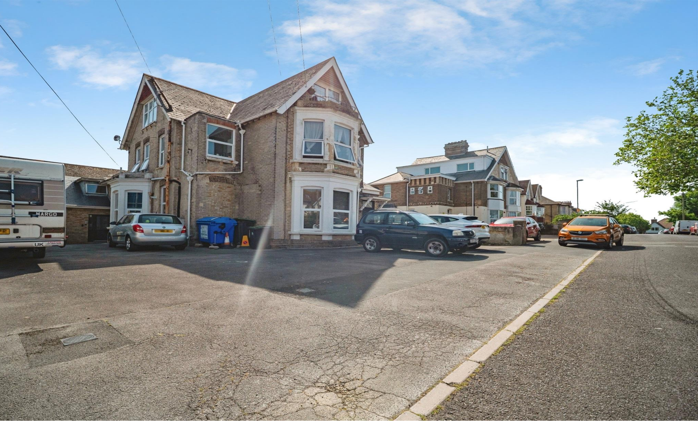
Glendinning Avenue, WEYMOUTH DT4 7QF

Not for marketing purposes INTERNAL USE ONLY