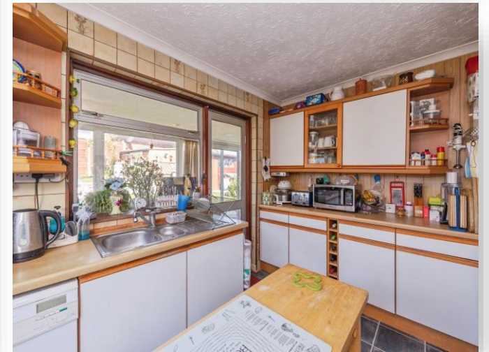
The Florins, Waterlooville PO7 5RJ