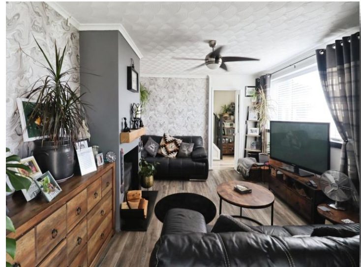
Walker Road, Barry CF62 8EN