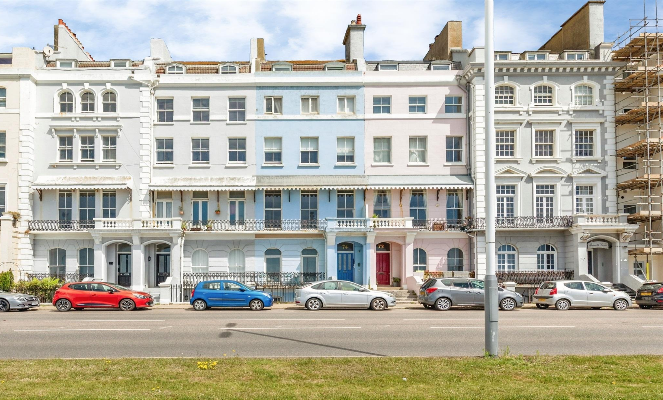
Marina, St. Leonards-On-Sea TN38 0BJ