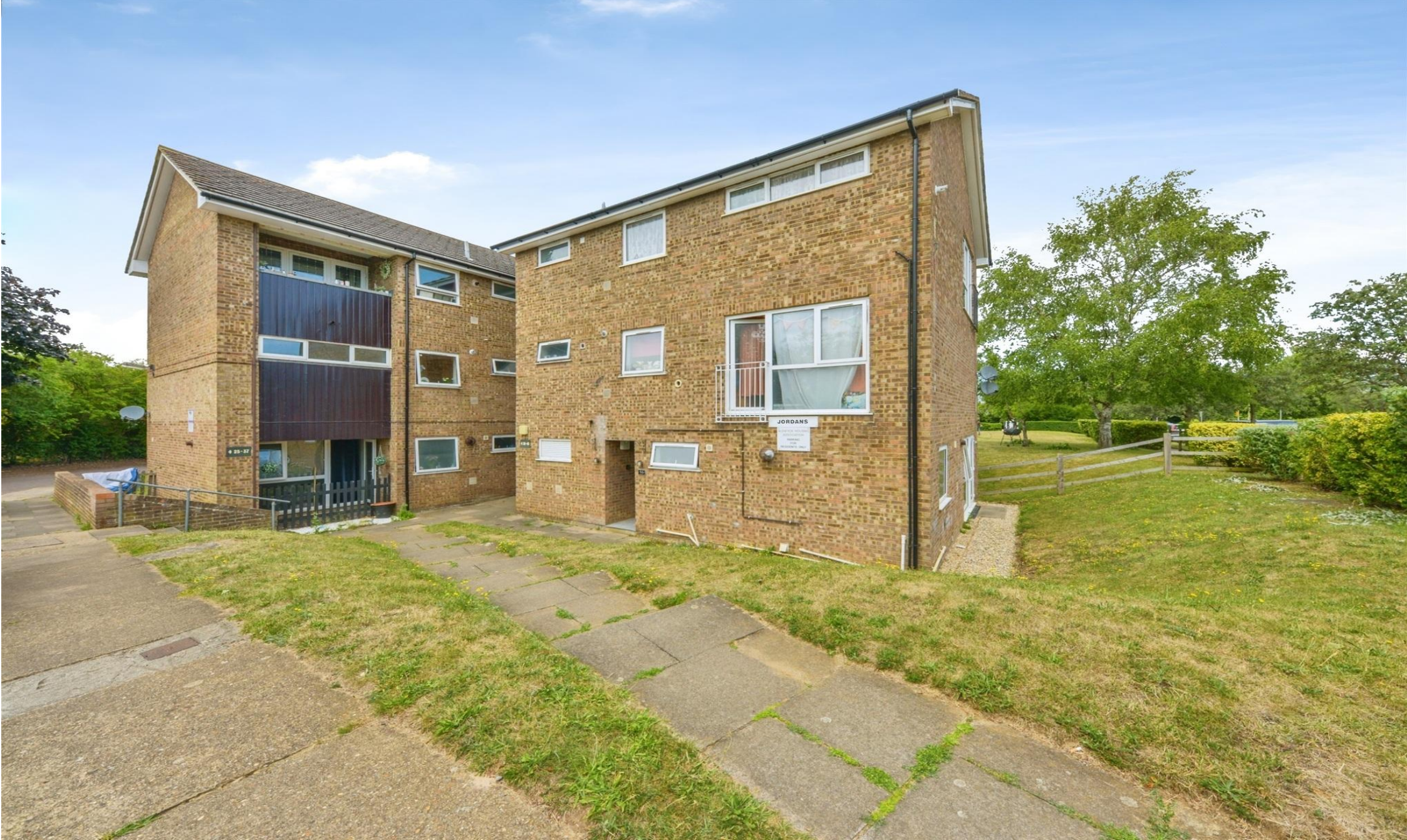
Jordans Hilly Fields, WELWYN GARDEN CITY AL7 2HD