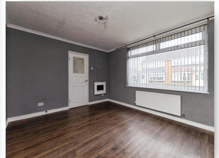
Cawood Drive, Middlesbrough TS5 7JP