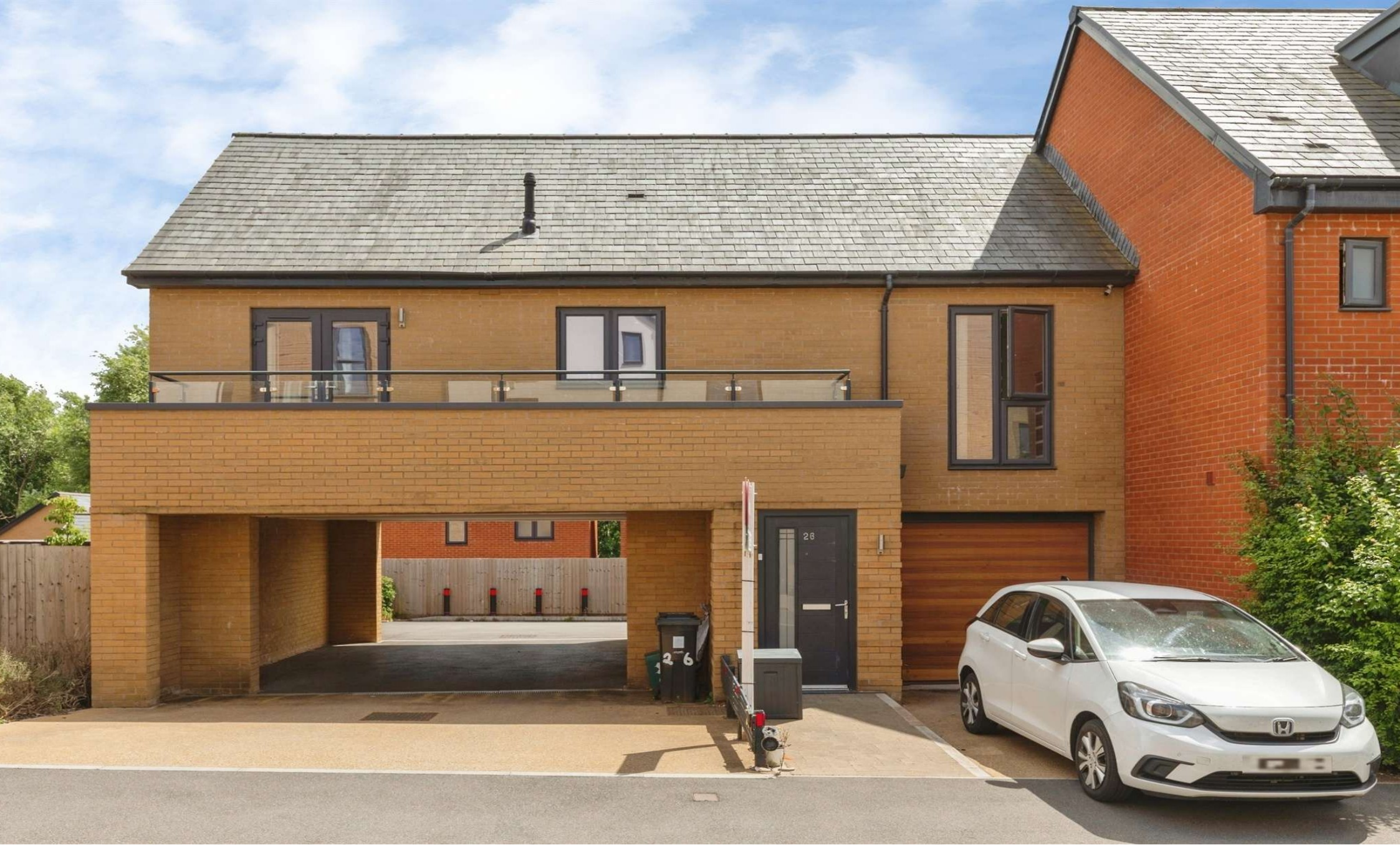
Aspen Drive, Bristol BS10 7UF