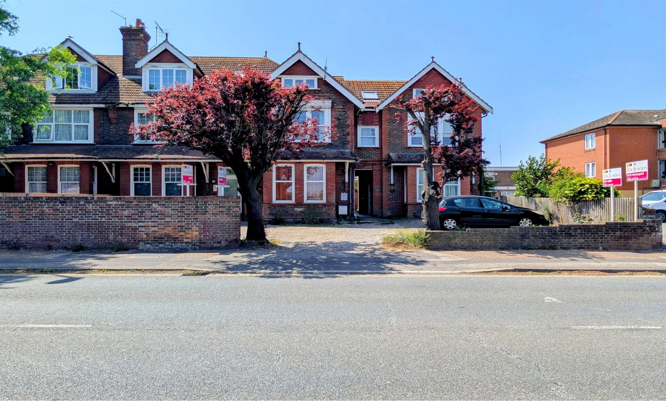
Broadwater Road, Worthing BN14 8AD