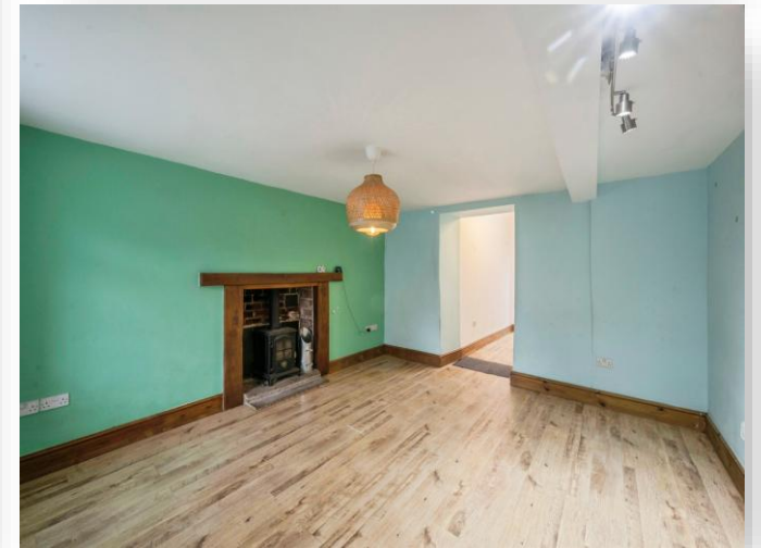
Angel Street, Bolton-Upon-Dearne Rotherham S63 8NA