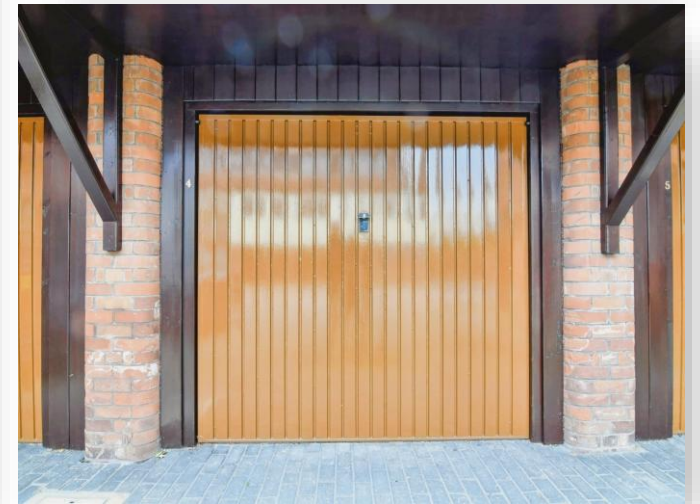
The Courtyard, Bancks Street, Minehead, TA24 5DJ