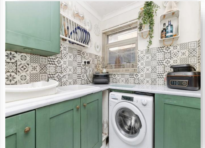
Leyburn Street, Hartlepool, TS26 9AJ