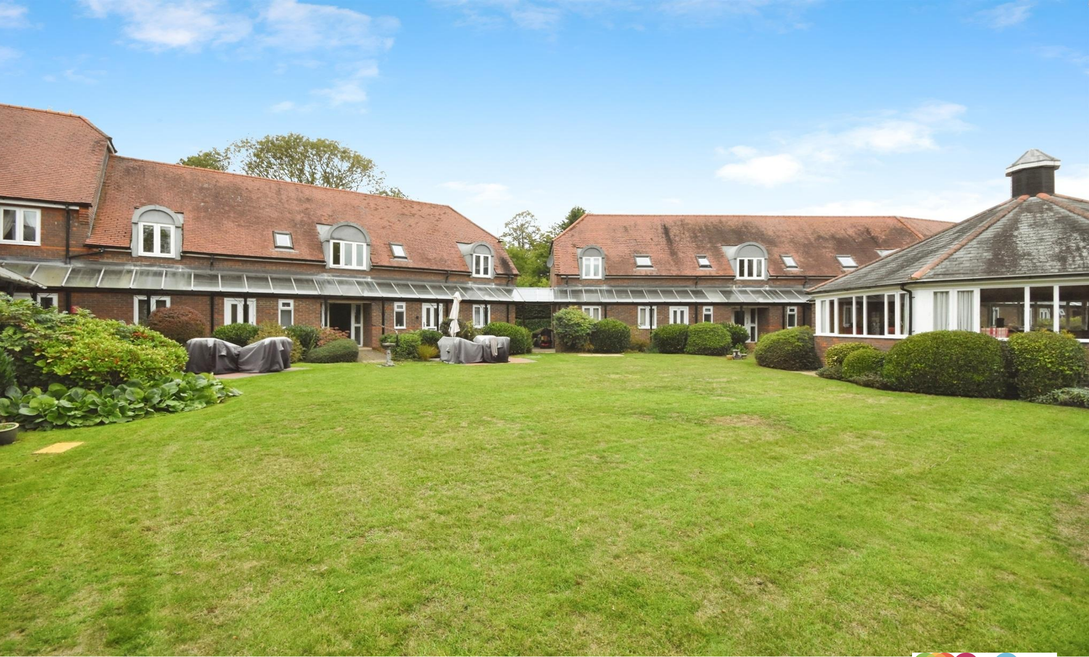
Lakes Meadow, Coggeshall, Colchester, CO6 1TN