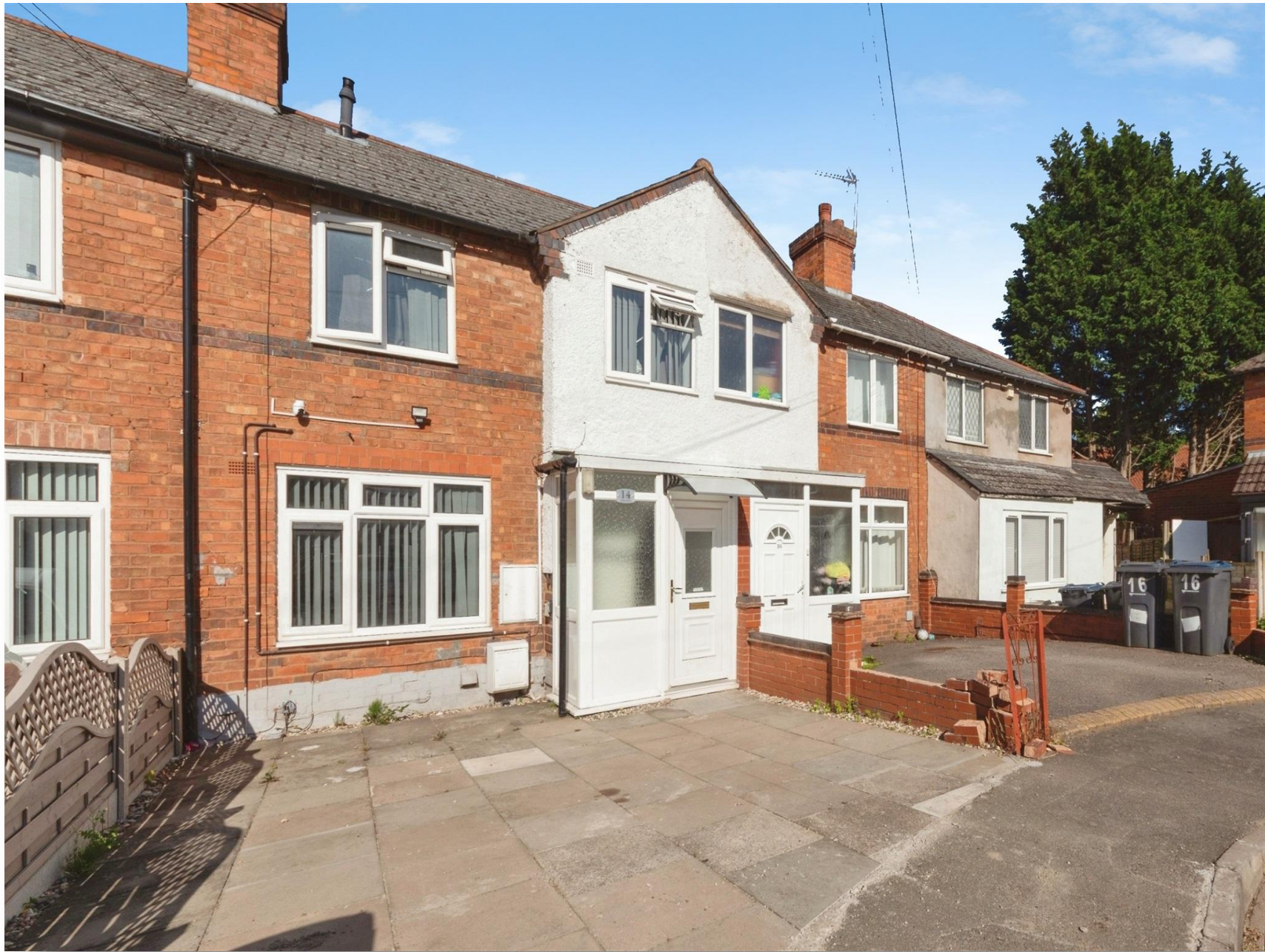
Arkley Grove, Birmingham B28 9PH