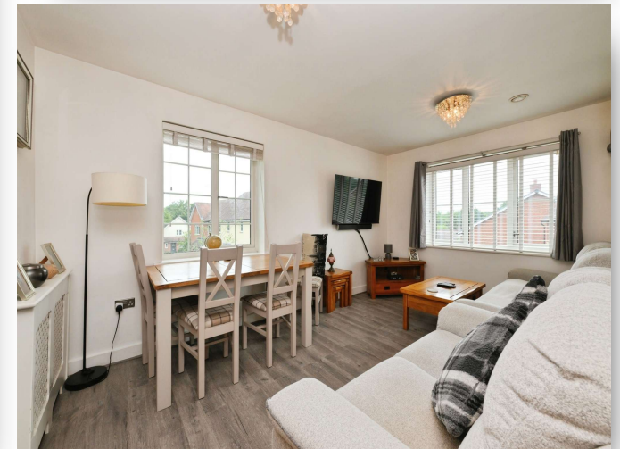
Clements Close, Puckeridge Ware SG11 1DE