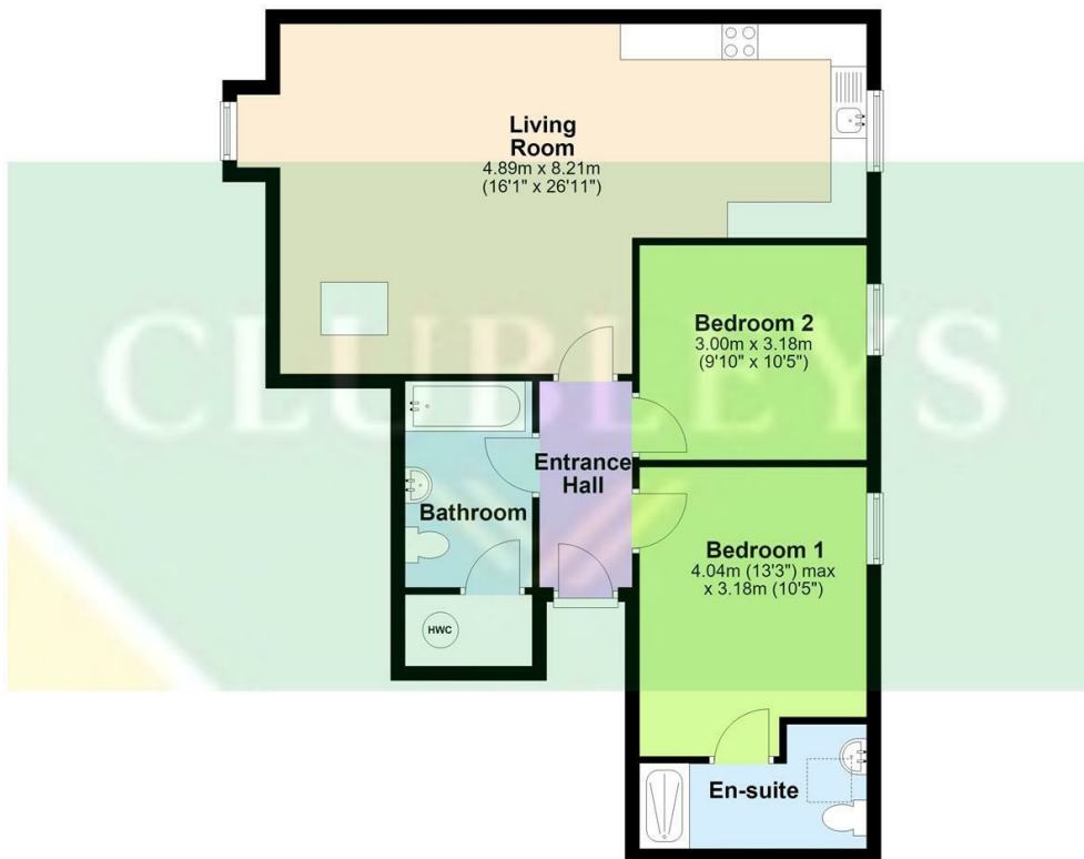
Total area: approx. 73.6 sq. metres (792.5 sq. feet)