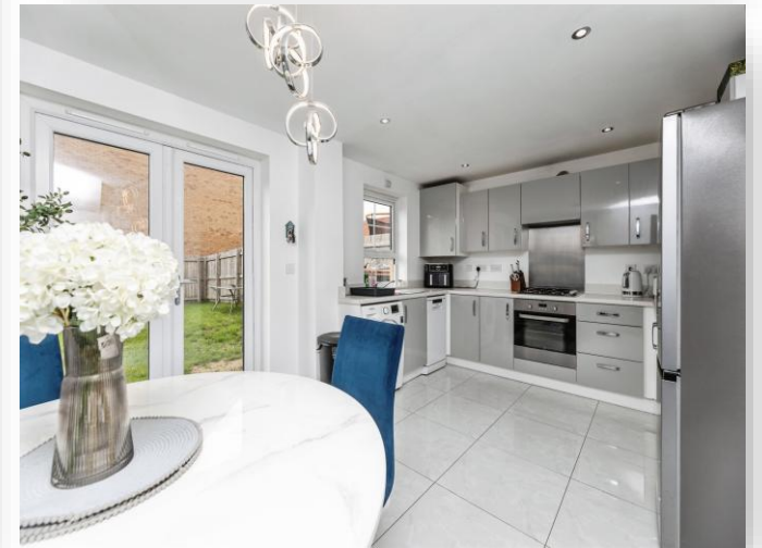
Crown Avenue, East Ardsley Wakefield WF3 2GH