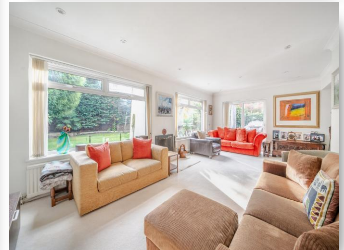
3 Frances Avenue, Maidenhead SL6 8NX