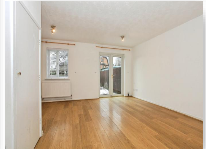
Stagshaw Drive, Peterborough PE2 8NQ