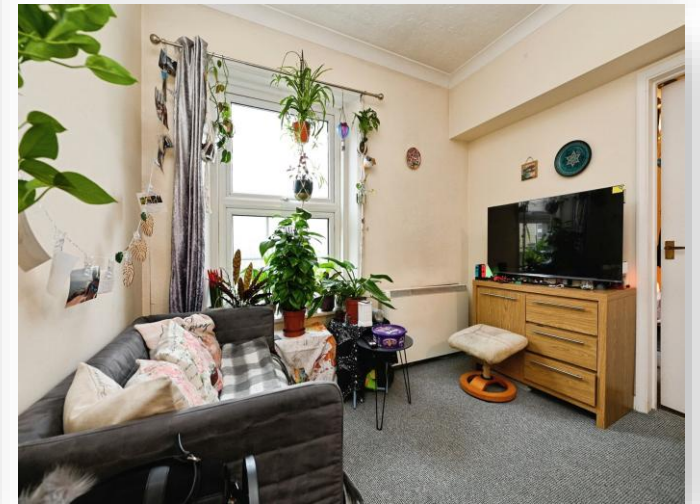
Turnpike Court, Norwich Road, Wisbech, PE13 3LX