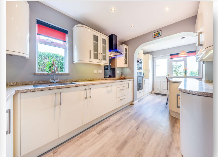
Waterloo Paddock, Leadenham Lincoln LN5 0QW