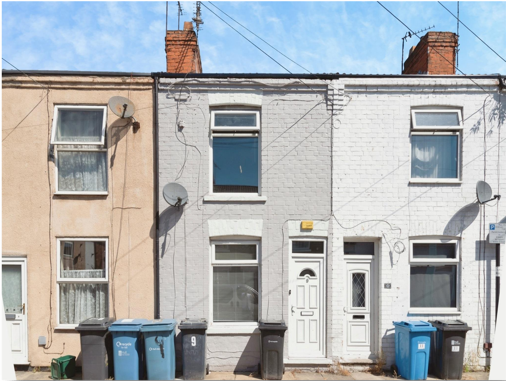
Whitby Street, Hull, HU8 7HN