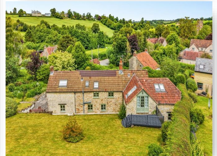
Hazelbank House, Kilmersdon, Radstock BA3 5SX