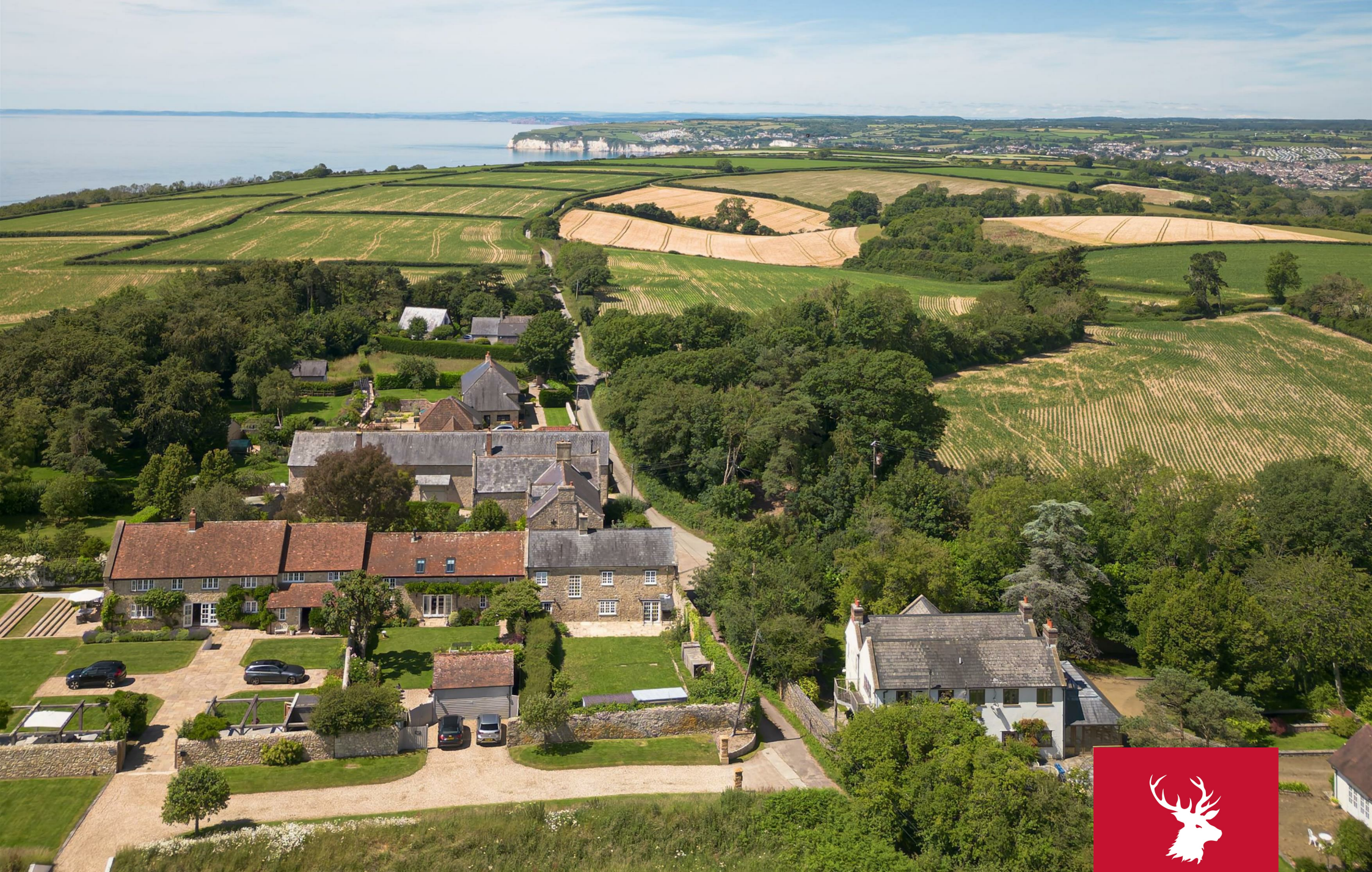
Dowlands Farm Cottage