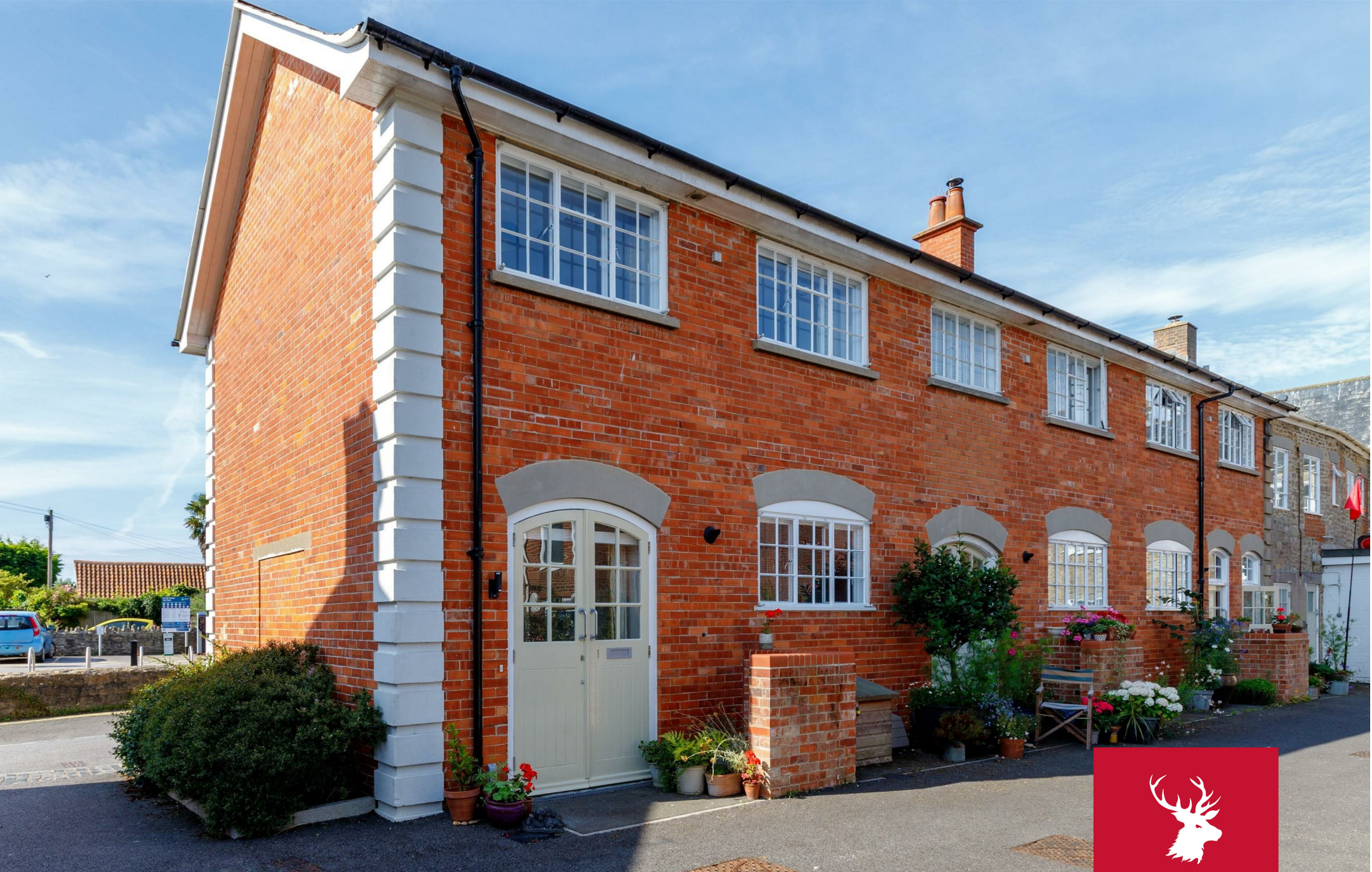
1 Church Place