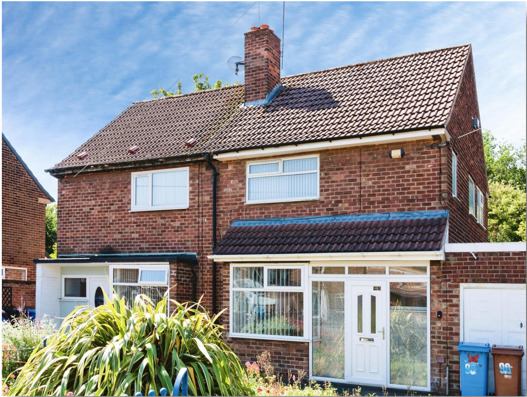
Bilsdale Grove, Hull, HU9 3US