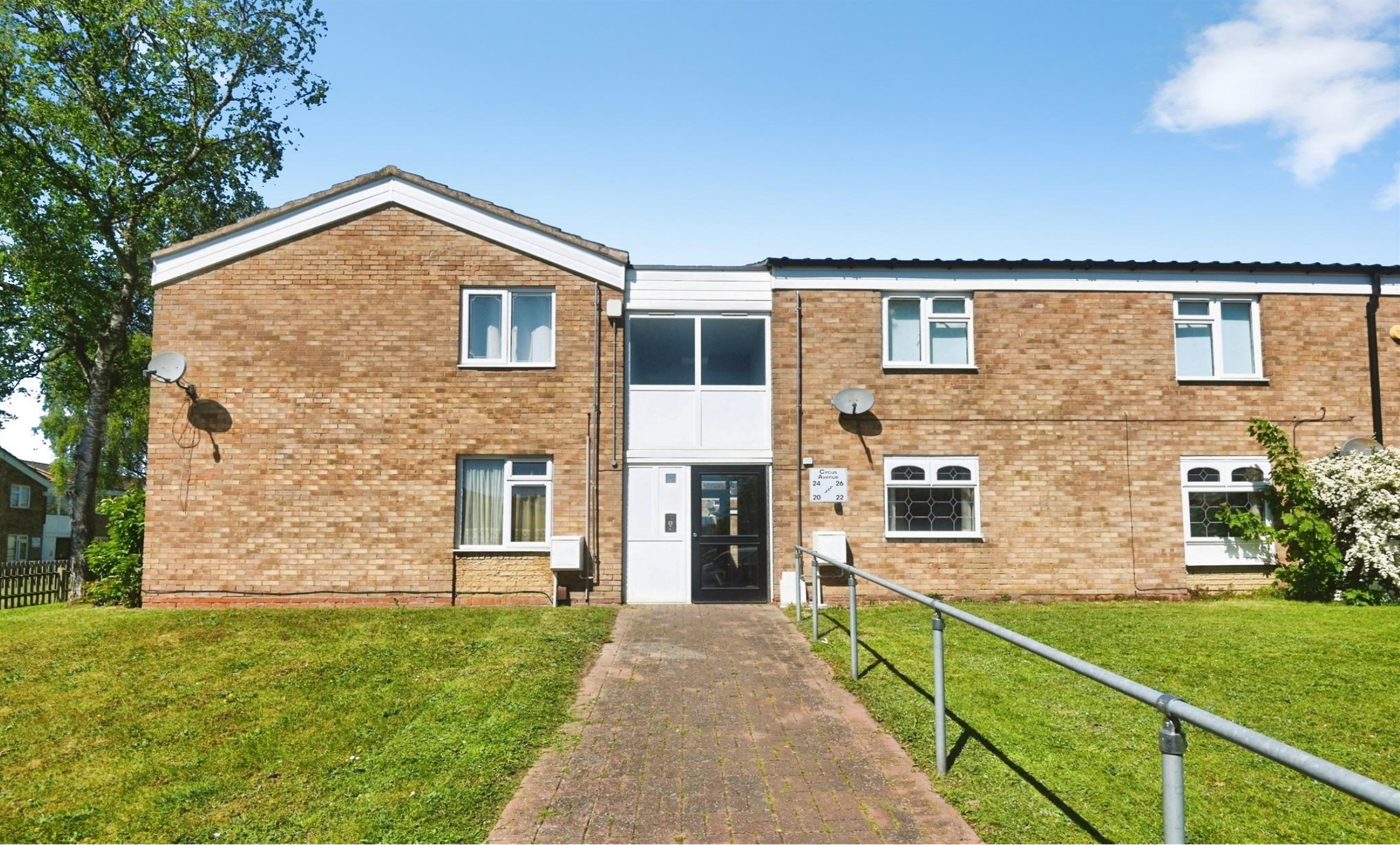
Circus Avenue, Chelmsley Wood Birmingham B37 7NH