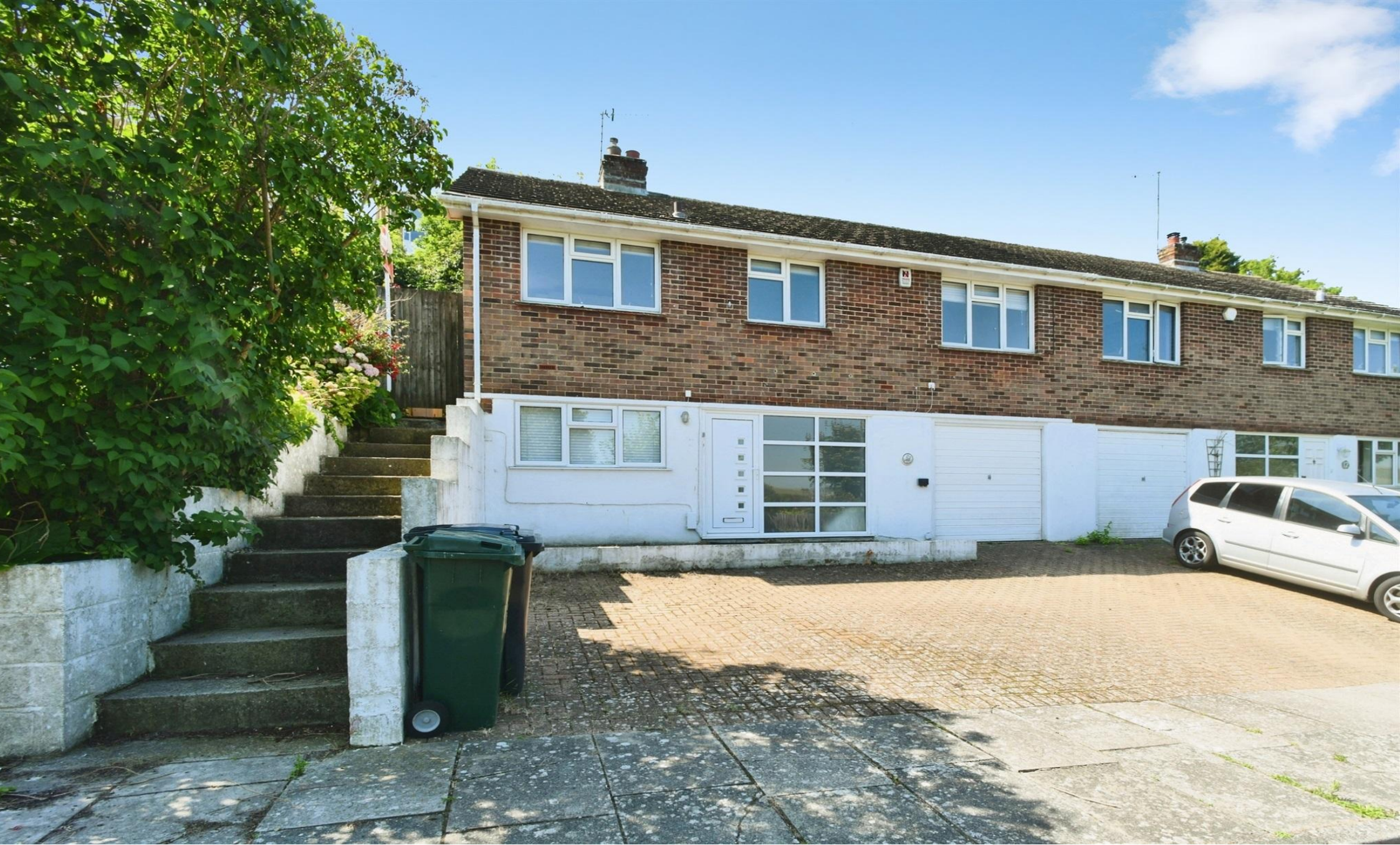
Westfield Rise, Saltdean BRIGHTON BN2 8HR