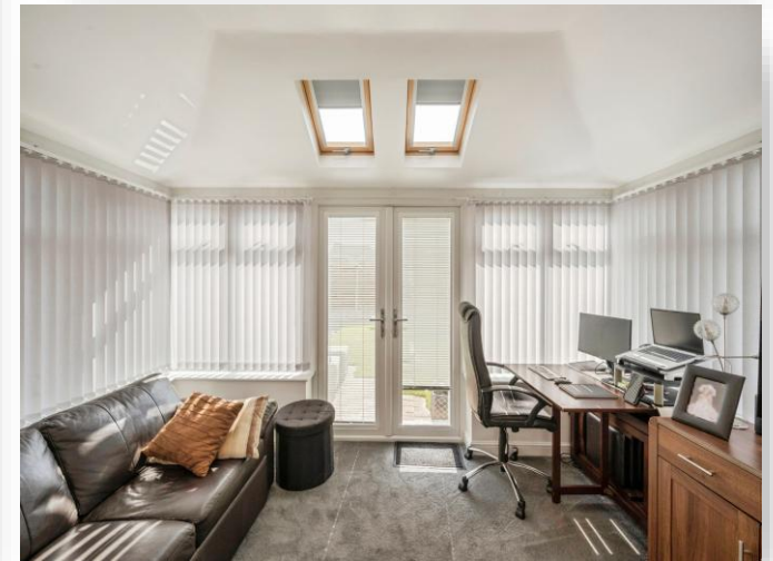
Lanark Drive, Mexborough S64 0QY