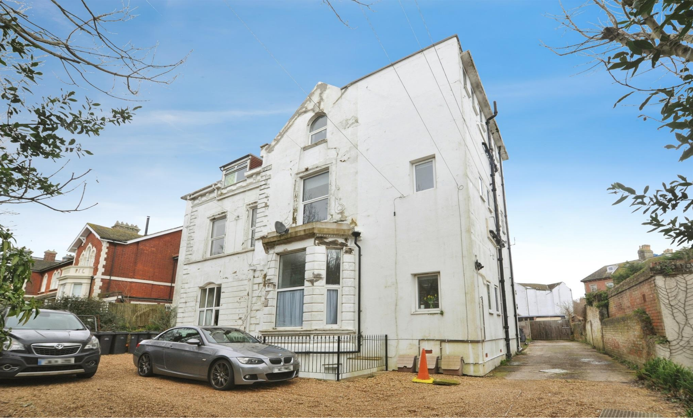
Upper Maze Hill, St. Leonards-On-Sea TN38 0LQ